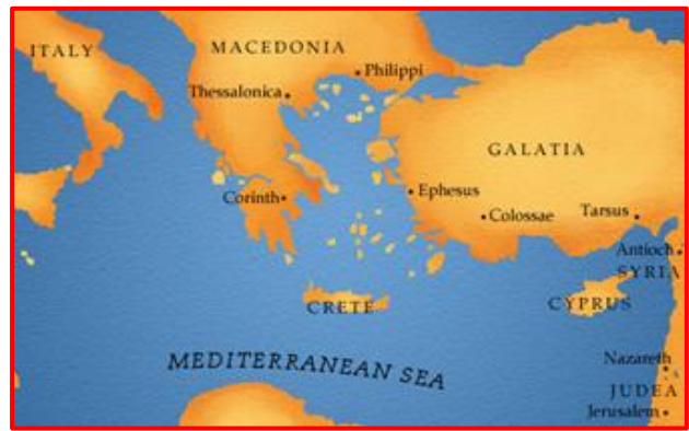
Map of Locations in St Paul's Letters

St Paul the Apostle is often considered to be the most important person after Jesus in the history of Christianity.